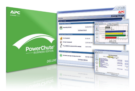
PowerChute Business Edition